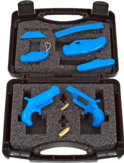
METAL DETECTOR TEST KIT