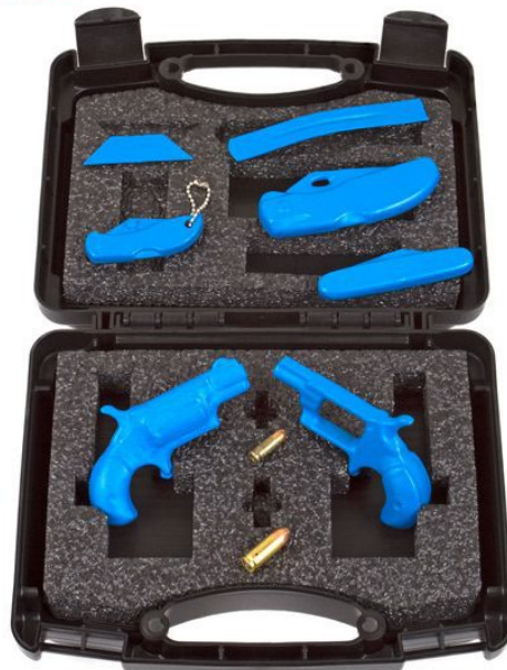
METAL DETECTOR TEST KIT